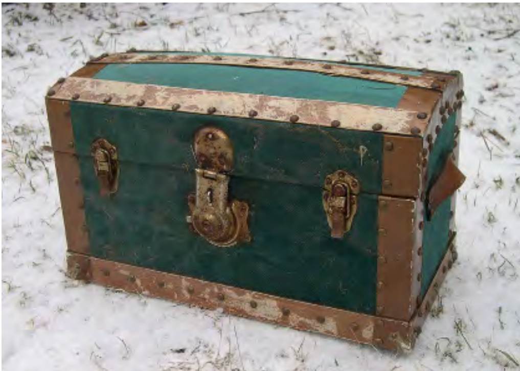
Unfortunately, by the time Arnold's chest washed up in Merrymeeting Bay, it was empty!

Miraculously no men were drowned and they were fished out wet, bedraggled and next to death. Plus all their personal belongings, and crucially there muskets lay at the bottom of the river. Fires were immediately built to prevent the freezing men from hypothermia and death. The march was halted as it was late and a soggy camp was made near the falls. This event was prominently described in the journals of some of the men. The site was appropriately named Camp Disaster.