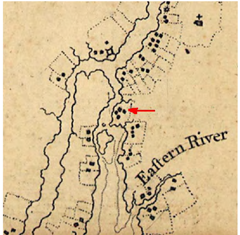
DeBarre chart, circa 1772 (British Navy Survey)